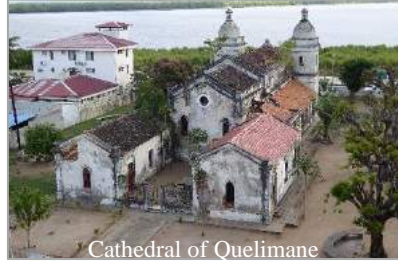
Cathedral of Quelimane