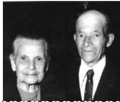
My mother and father

Only three weeks later, on July 4 th , 1965, in my home Parish in Ponta do Sol, after travelling from Mozambique to Madeira, surrounded by my family, many friends, many neighbours and many Parishioners, I celebrated my First Mass in Madeira Island. Exactly in the same church where I had been baptized, received my First Holy Communion and Confirmation.